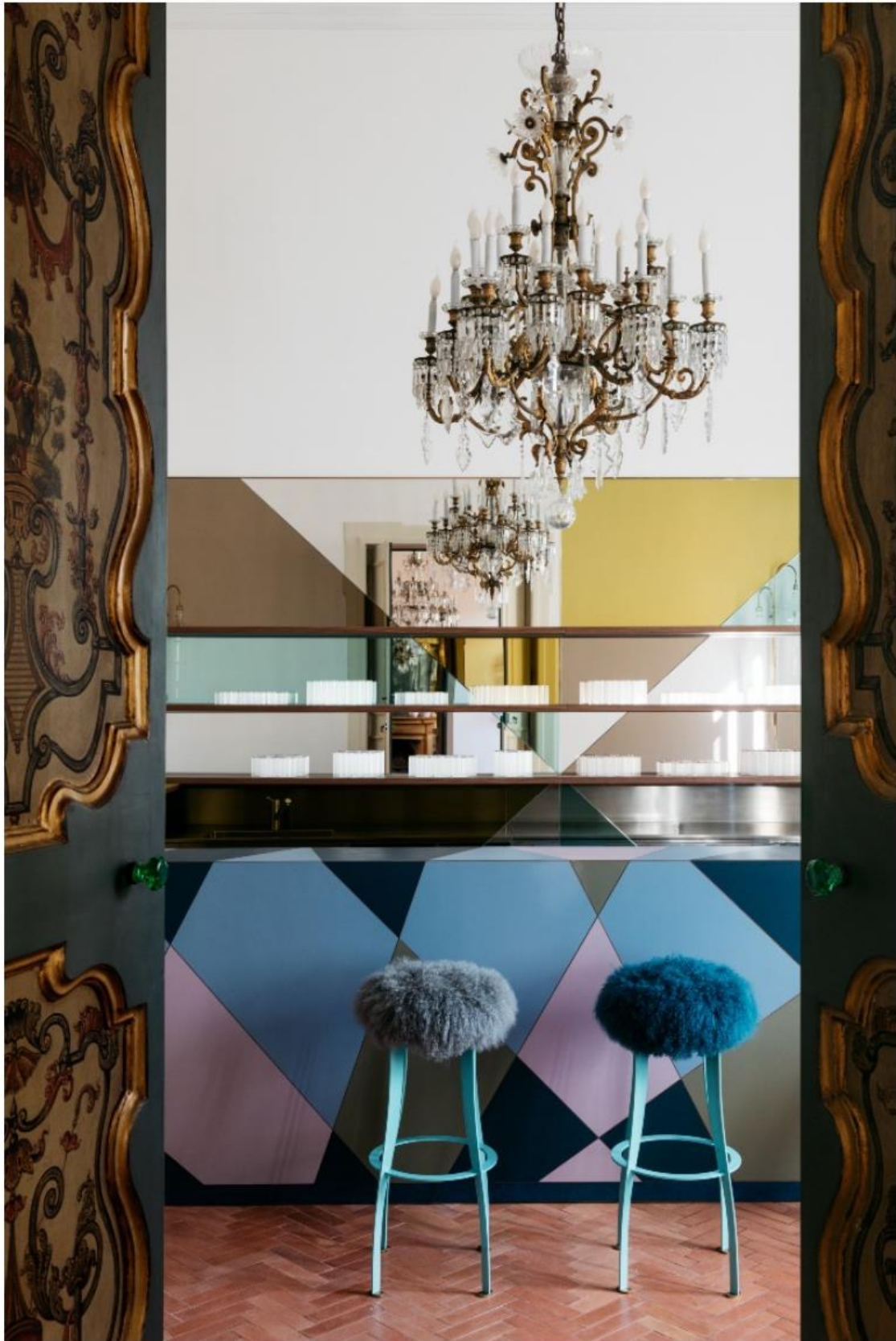
Bonus is the Plates room, a private workout area just off the garden, designed by Giuliano Deii Uva Architetti with the incredible Merrithew Stott machines.