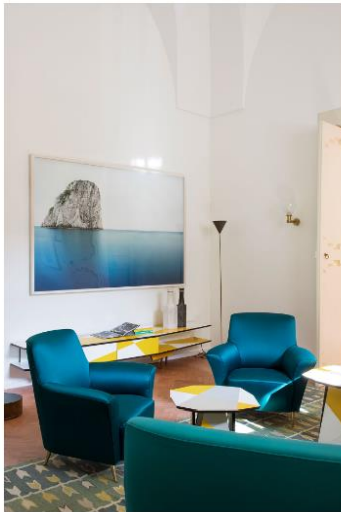
Living Room.