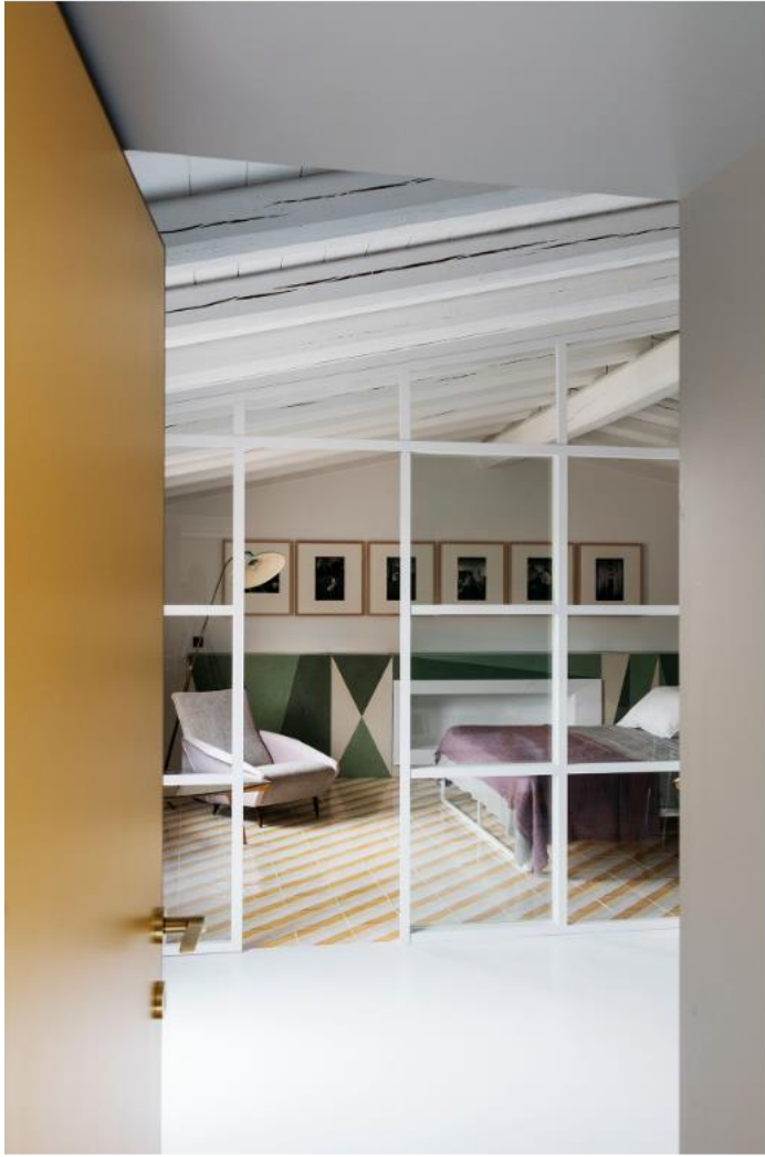
ROSSO PONTI suite.