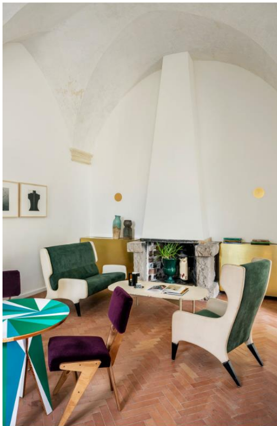
Breakfast Room.