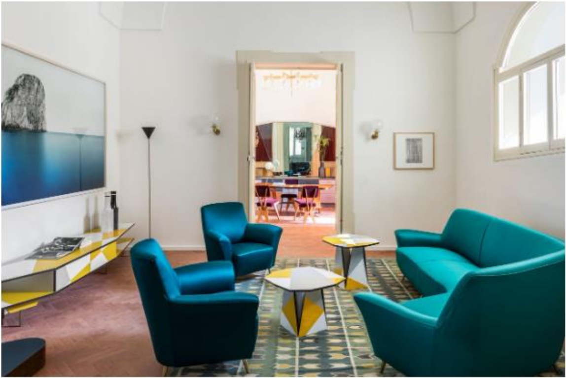
Living Room.