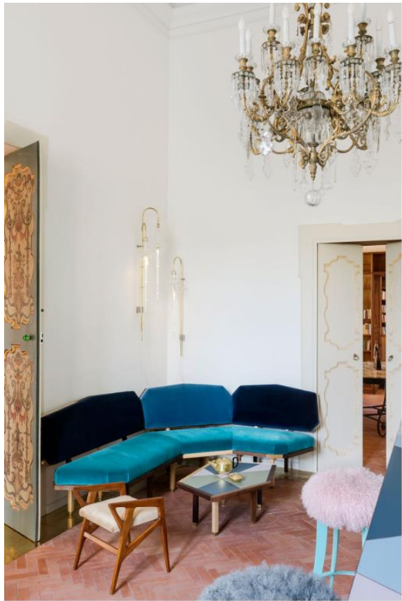
Gamber Bar.