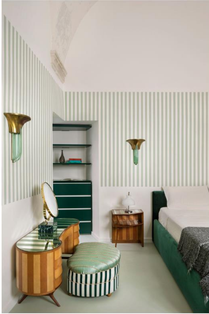
PASSAGGI Suite.