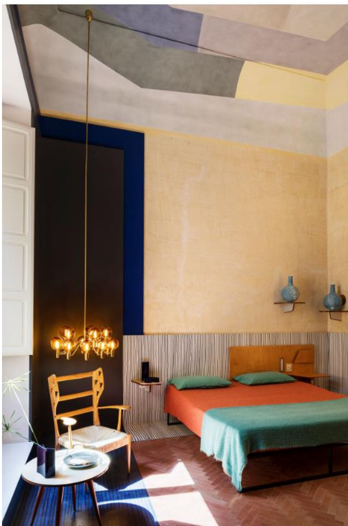
MARIA D'ENGHEN Suite.