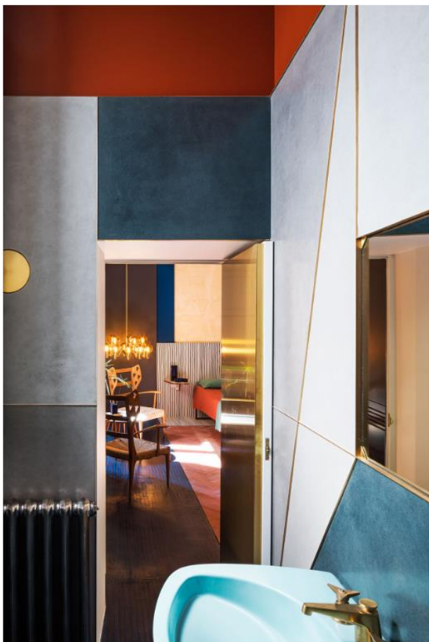
MARIA D'ENGHEN Suite.