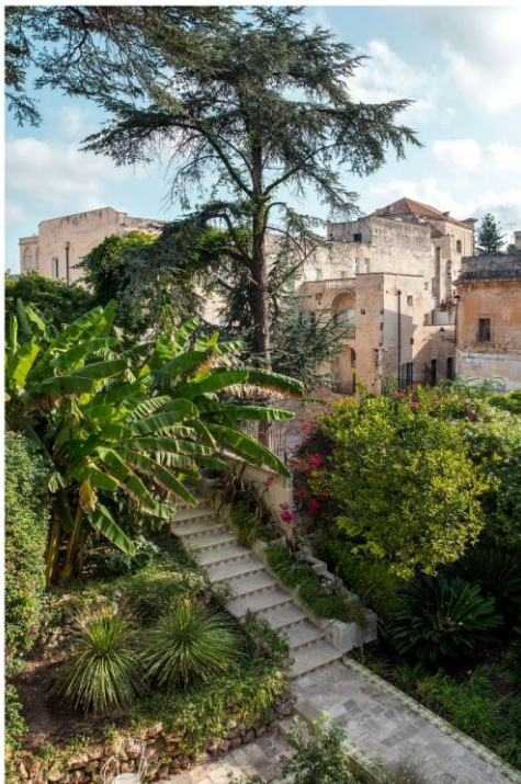
Garden.