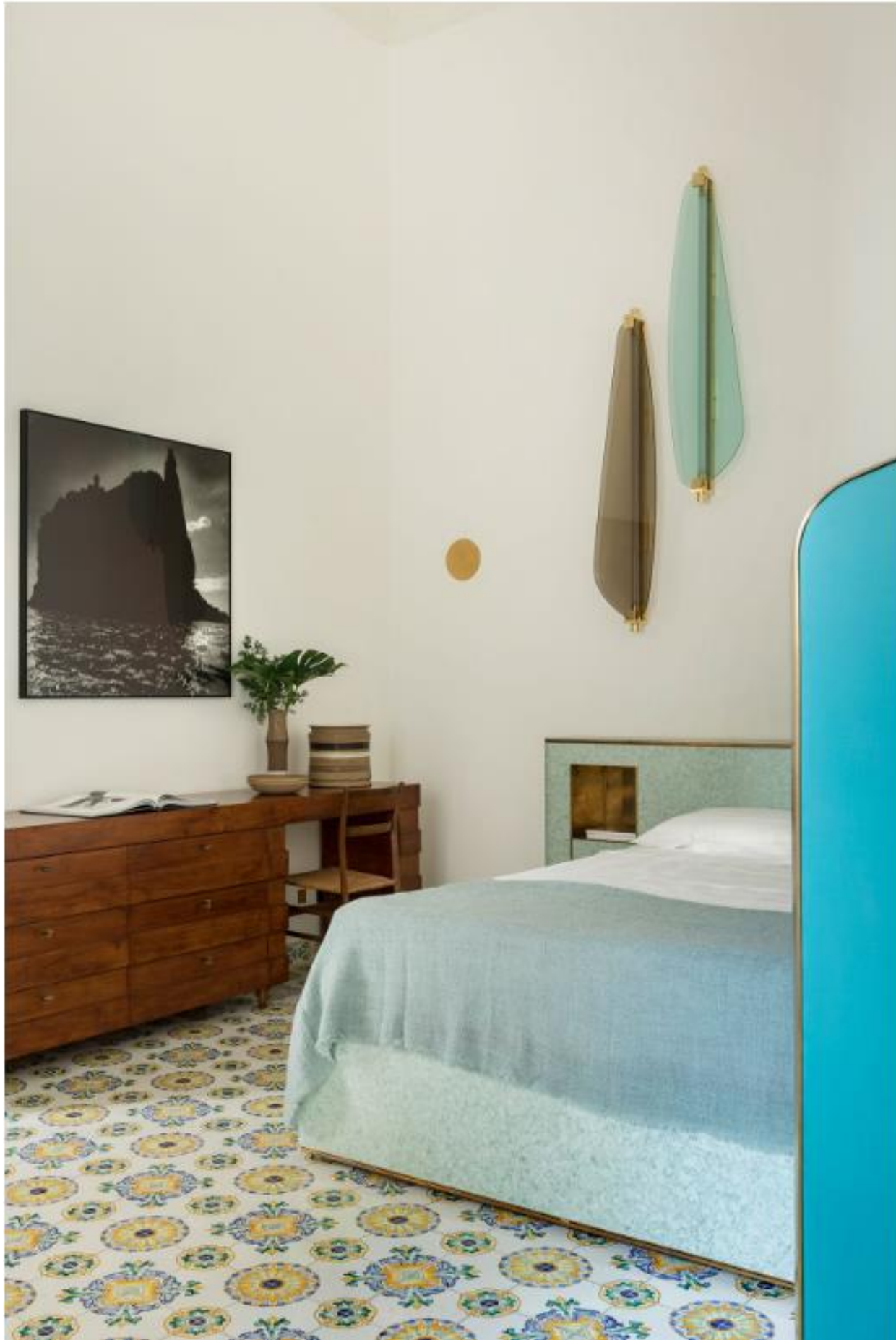
FANCIULLINO Suite.