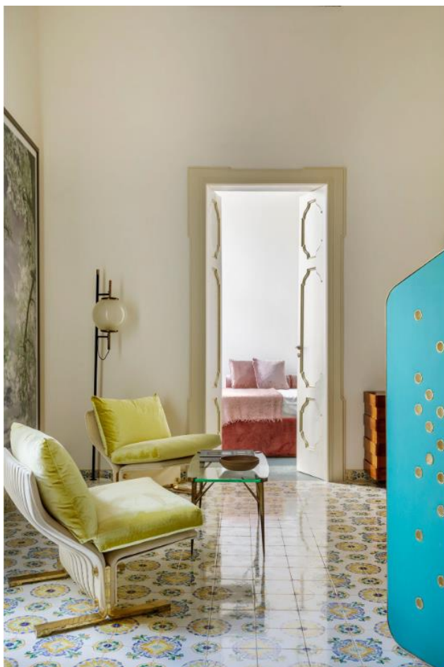
FANCIULLINO Suite.