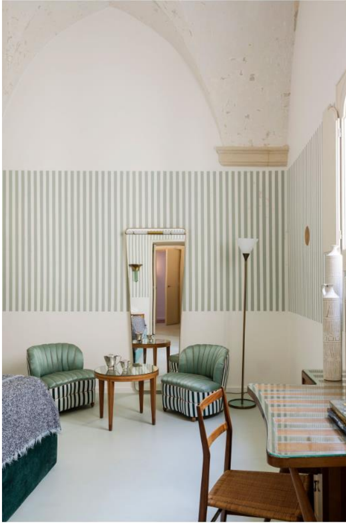
PASSAGGI Suite.