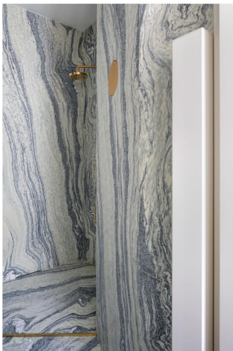
PASSAGGI Suite.