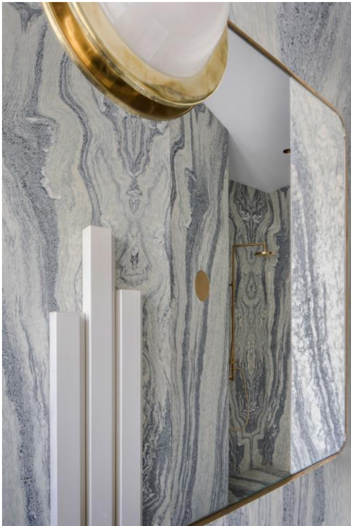
PASSAGGI Suite.