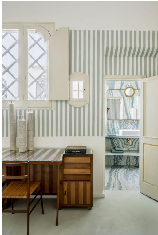
PASSAGGI Suite.