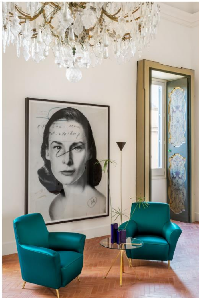
The Music Room.