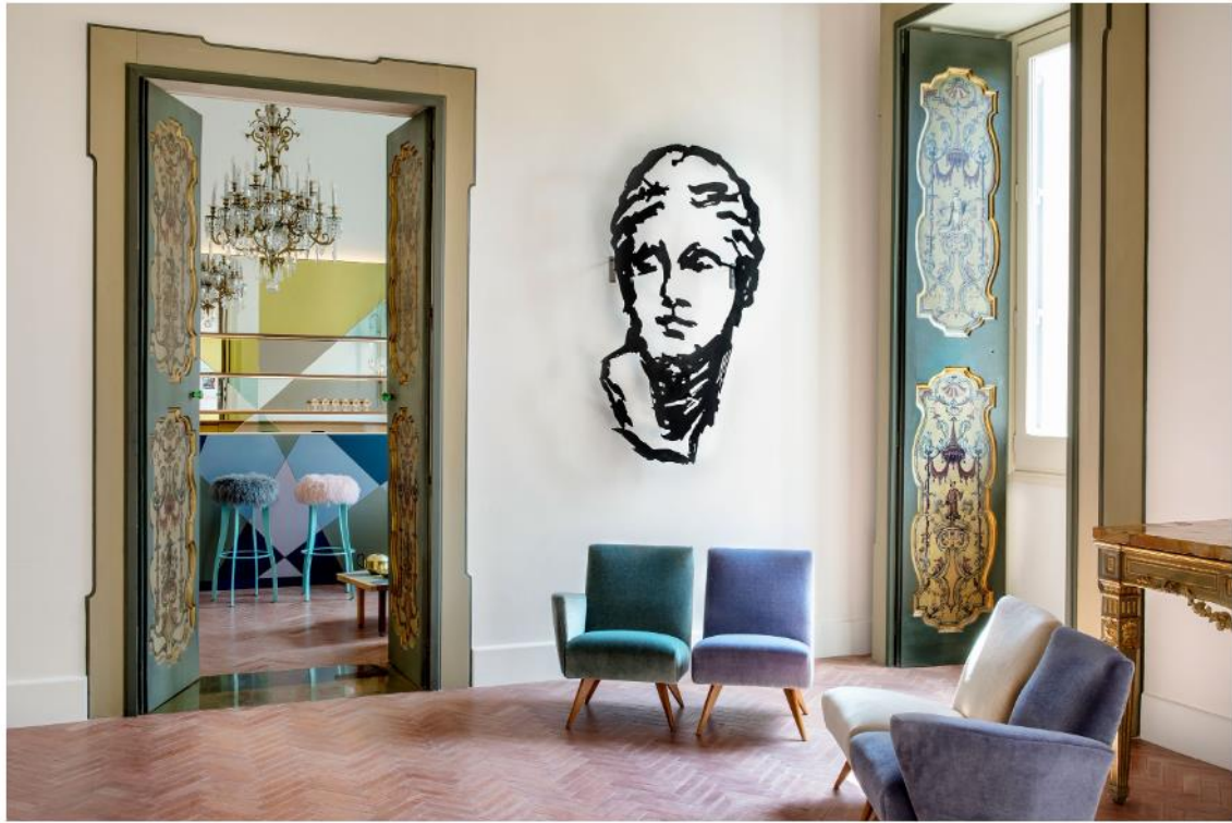
The Music Room.