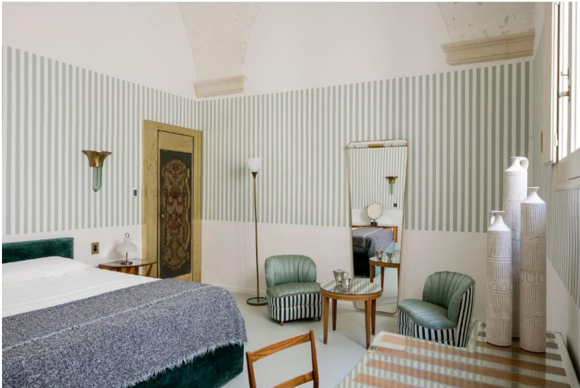
PASSAGGI Suite.