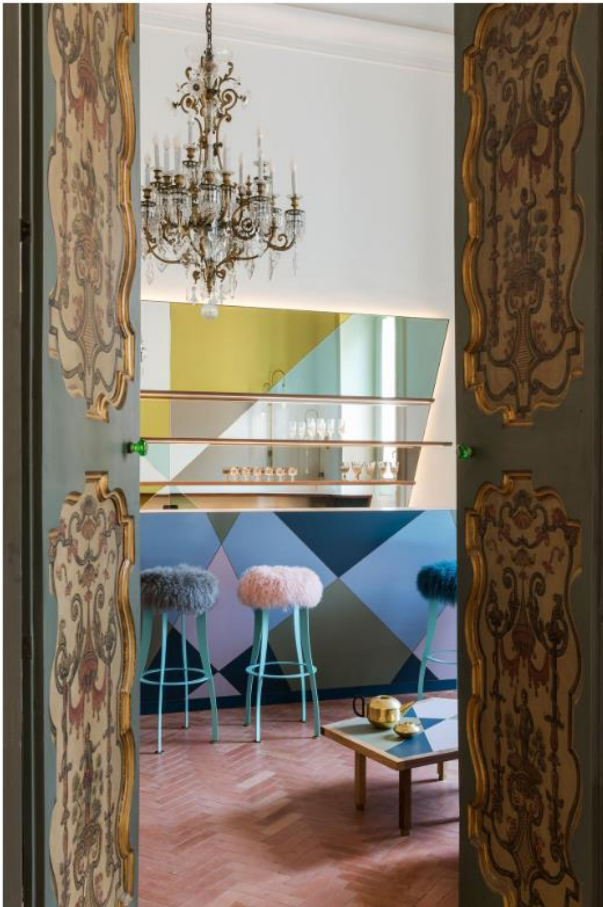
Gamber Bar.