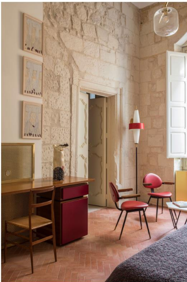
LUCE Suite.