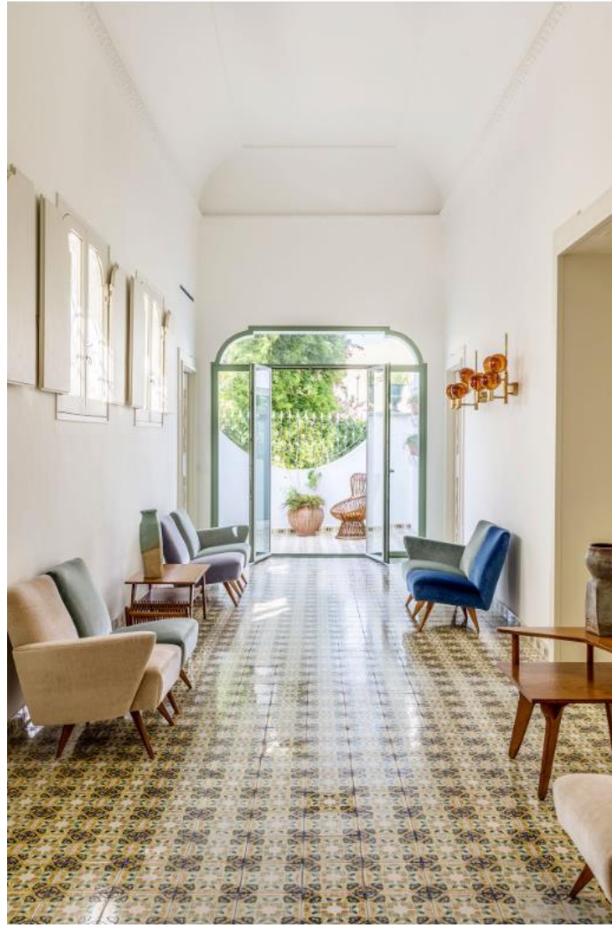
Majolica Gallery.