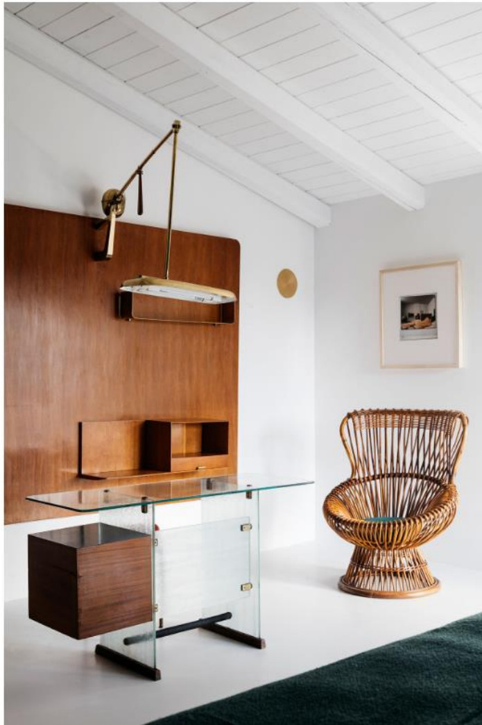
BLUE PONTI Suite.