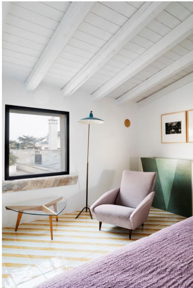
ROSSO PONTI suite.