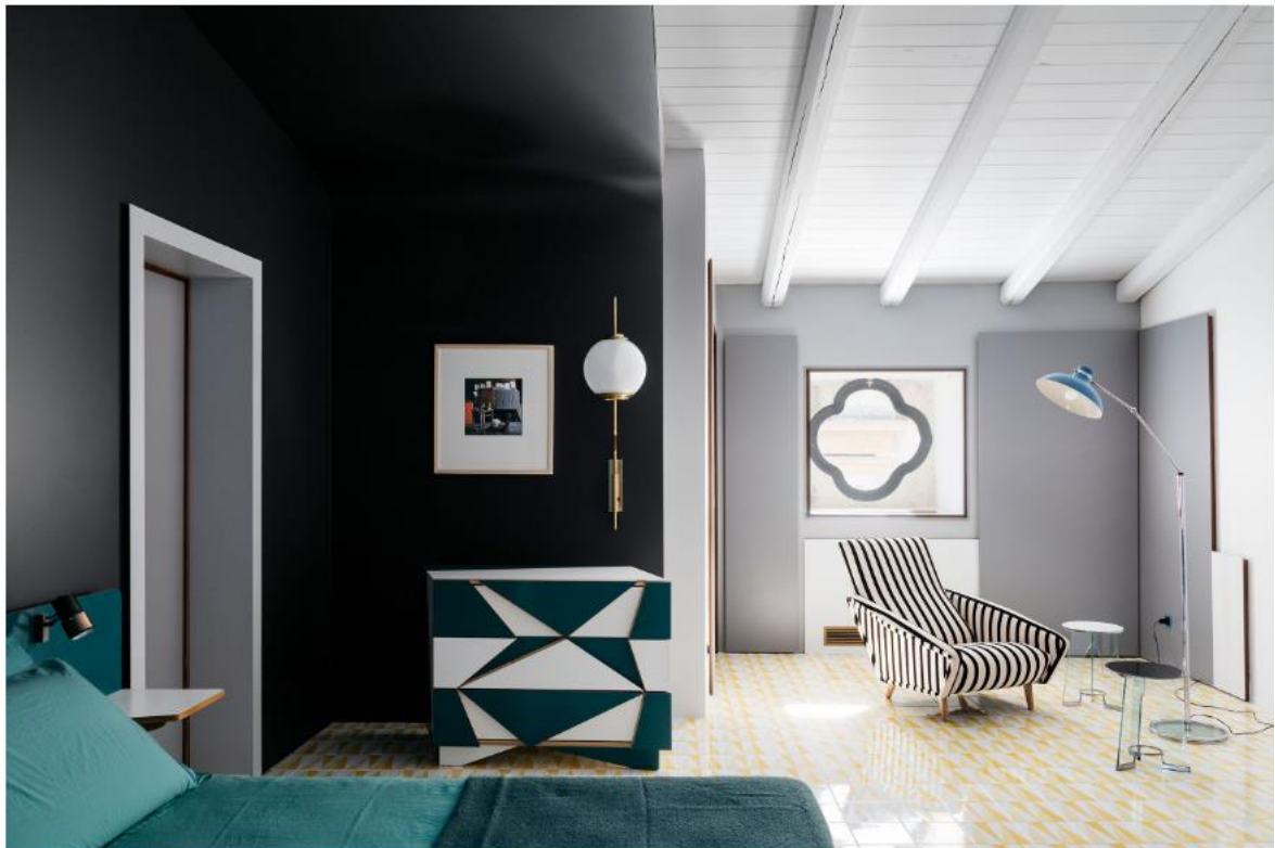
BLUE PONTI Suite.