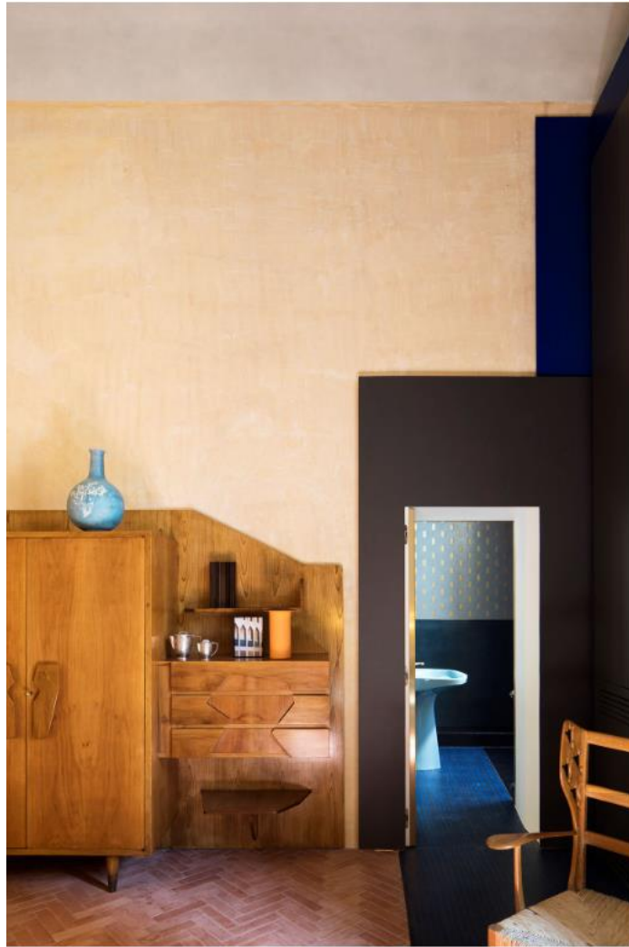
MARIA D'ENGHIEN Suite.