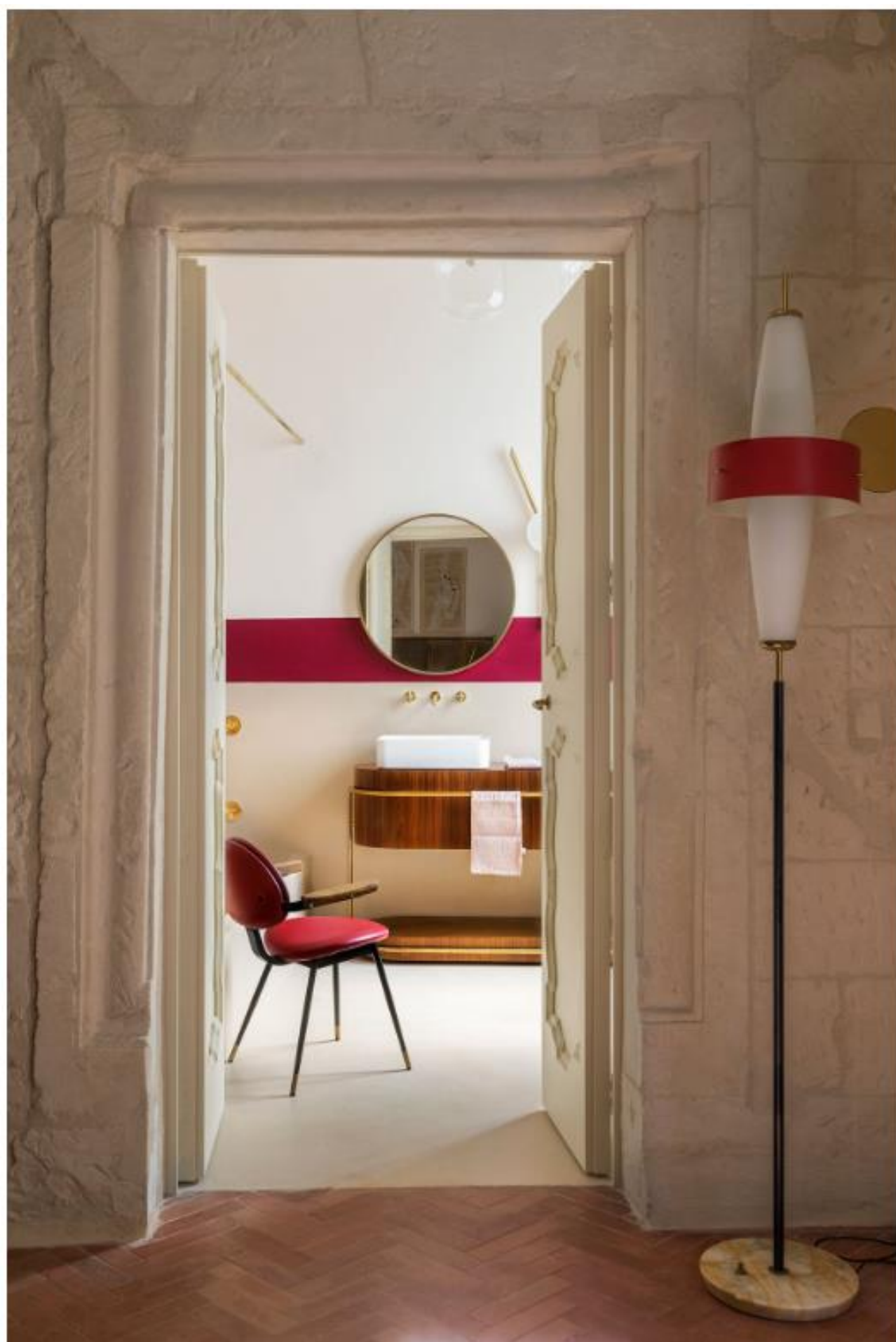
LUCE Suite.