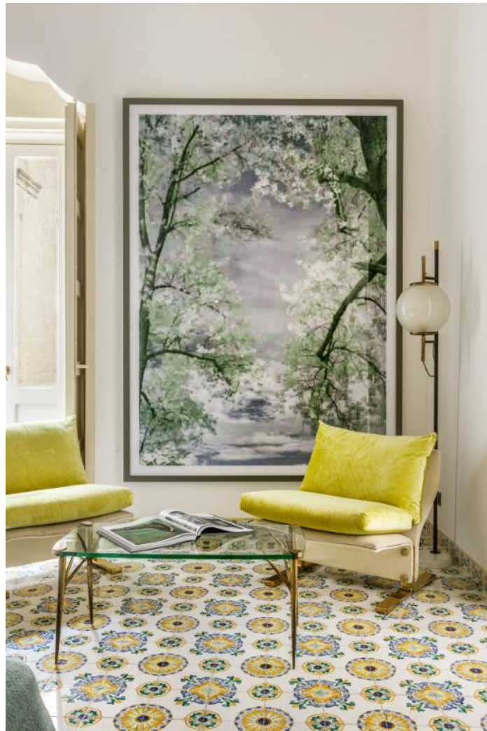
FANCIULLINO Suite.