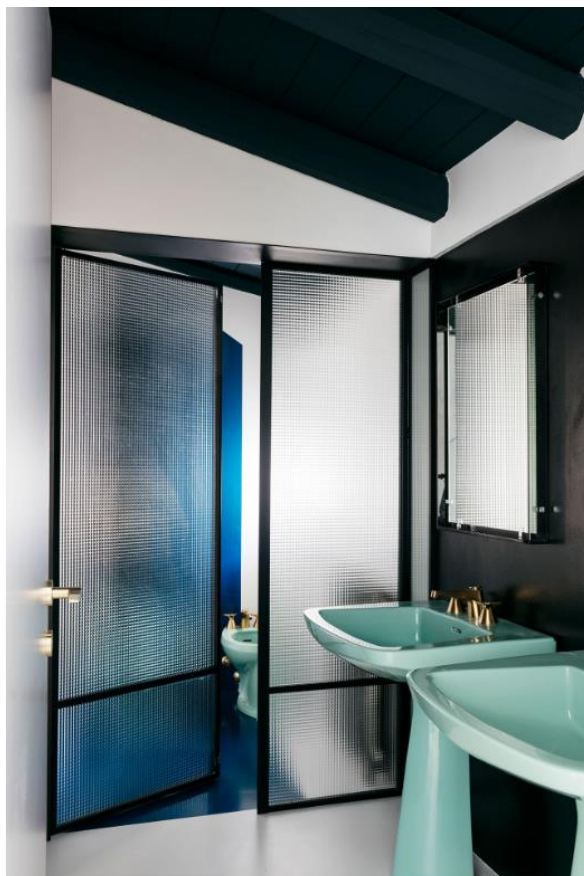
BLUE PONTI Suite.