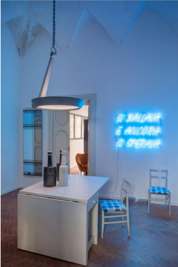
Living Room.