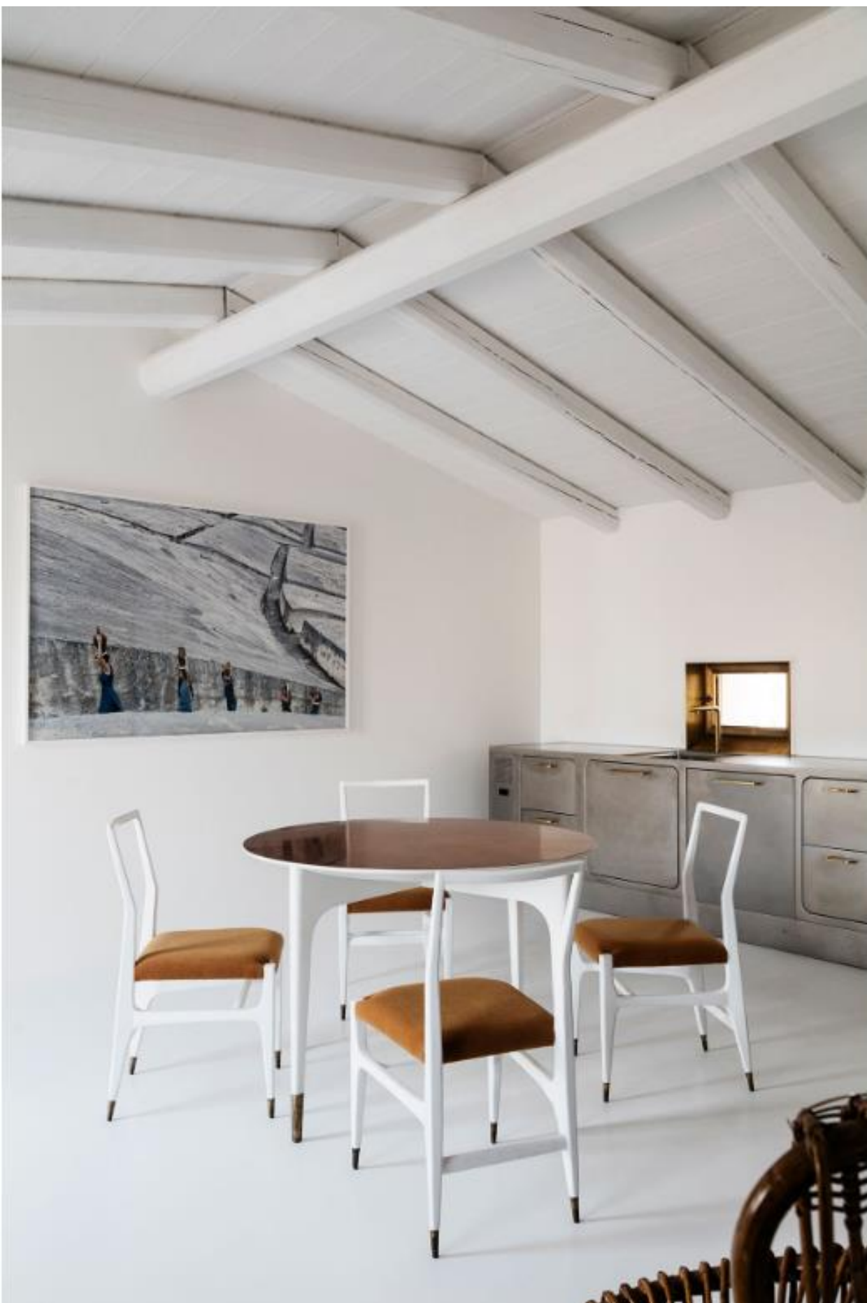
ROSSO PONTI suite.