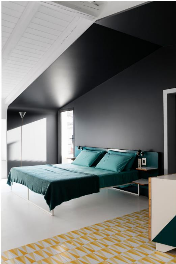
BLUE PONTI Suite.