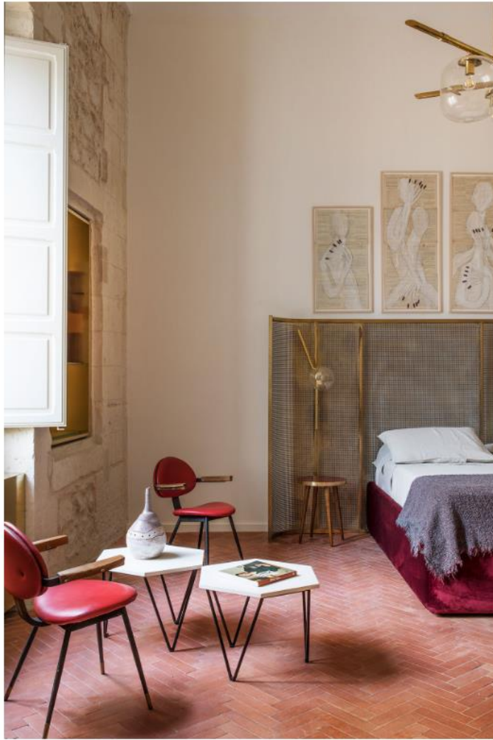
LUCE Suite.