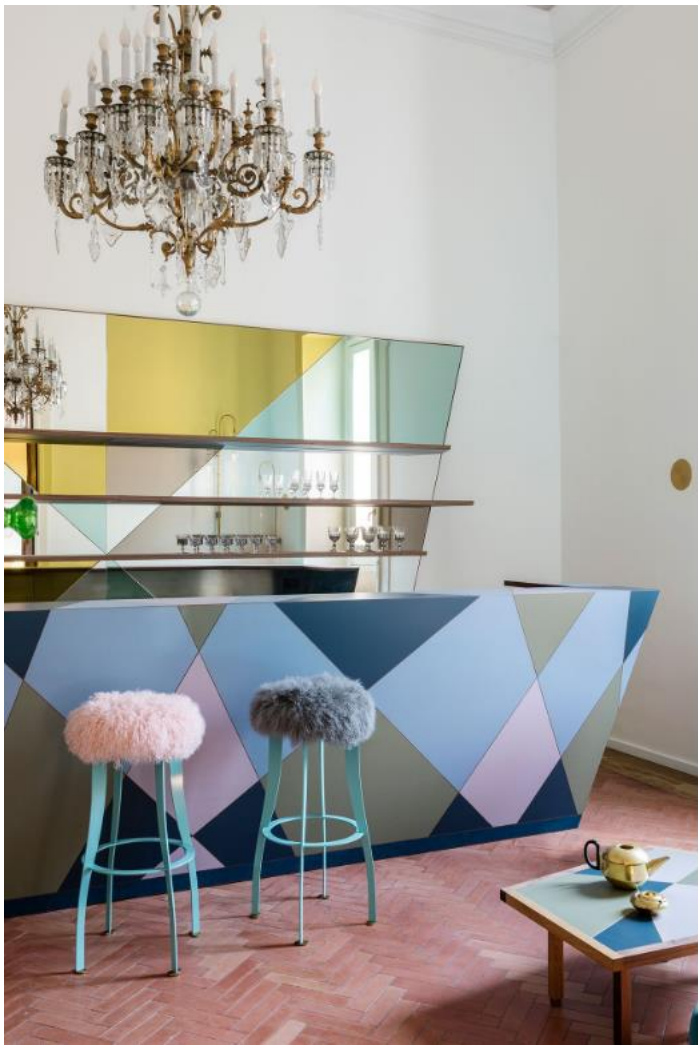
Gamber Bar.