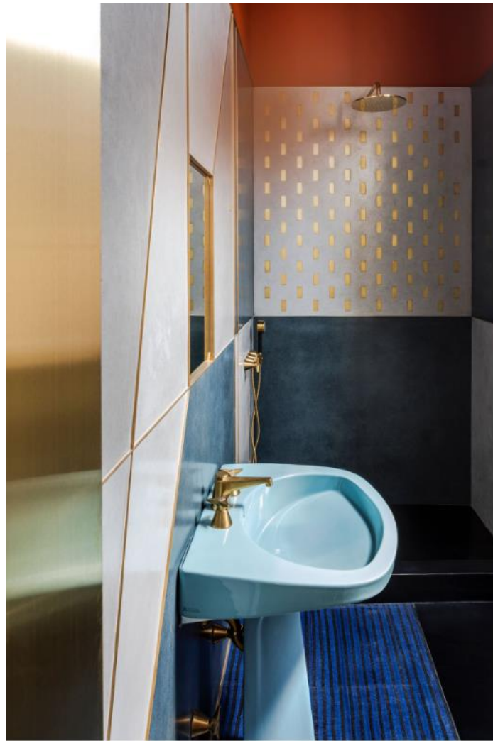
MARIA D'ENGHEN Suite.