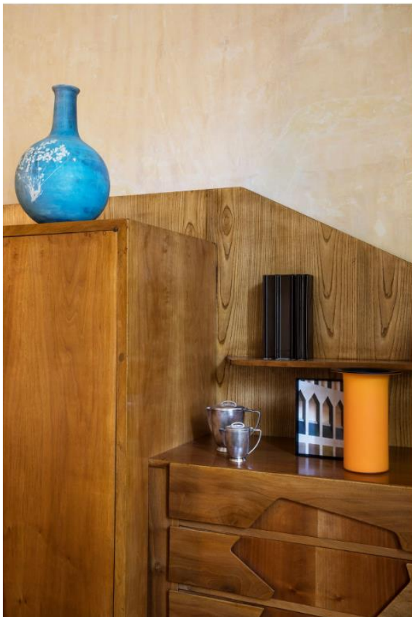
MARIA D'ENGHIEN Suite.